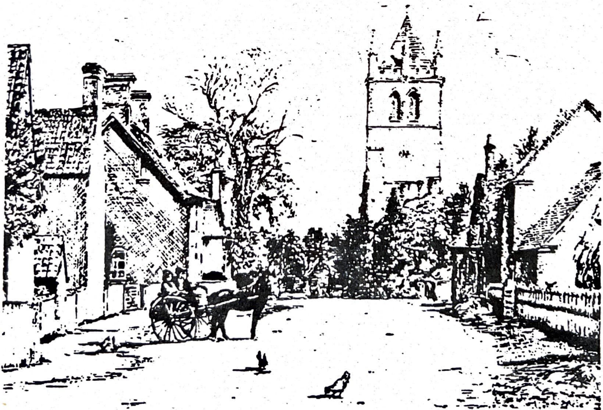
High Street, Laxton (cira 1910) by Graham Laughton