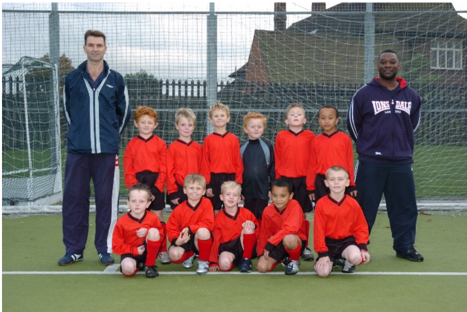
Balderton Athletic Football Club under 7 team