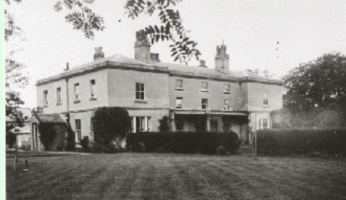
Coddington Hall, demolished around 1960